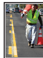
City of Long Beach