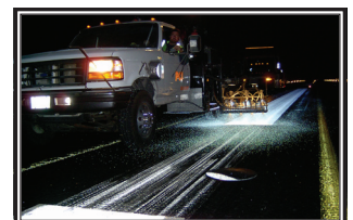
San Diego International Airport