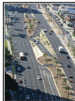
City of Los Angeles